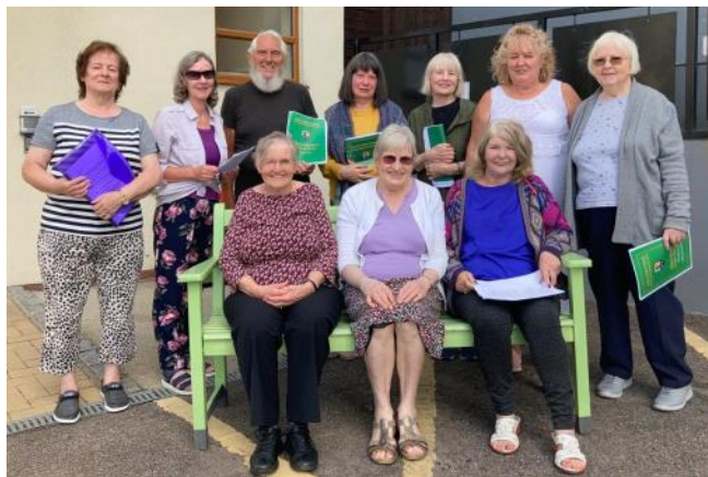
The Memorial Mass will include hymns sung by the choir.