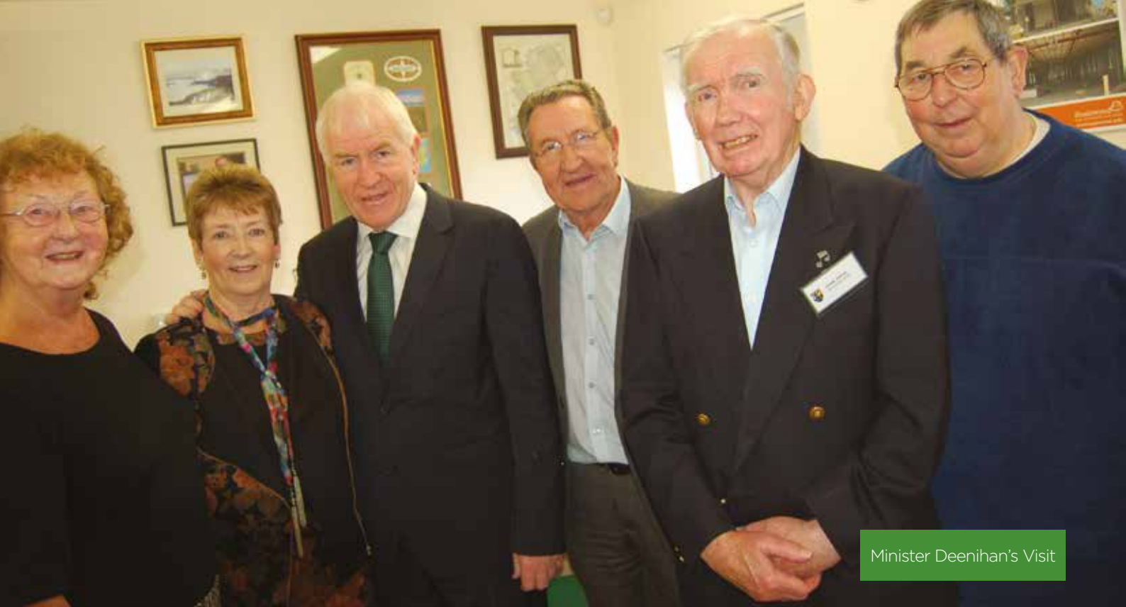
Minister Deenihan's Visit