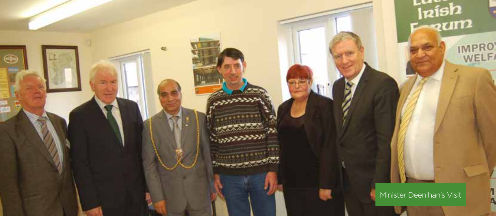
Minister Deenihan's Visit