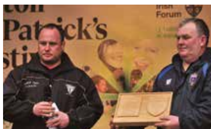
Committee member from Éire Óg speaking from the main stage

Breakfast, the Conway Lally School of Irish Dancing, Leagrave Comhaltas and many more ensuring there is something for everyone.